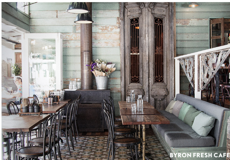
BYRON FRESH CAFE

Spell Byron Bay's online outpost delivers plenty of festival fashion inspo, one snapshot at a time.