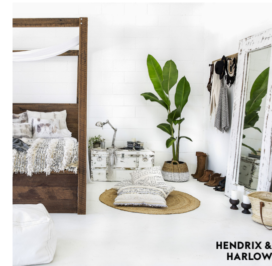
HENDRIX & HARLOW

3/20 Fletcher St, Byron Bay; 02-6680 9190